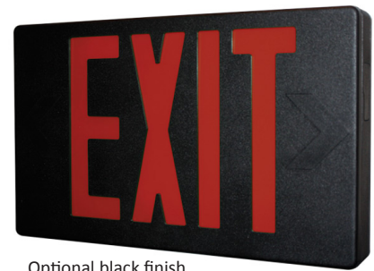
Optional black finish