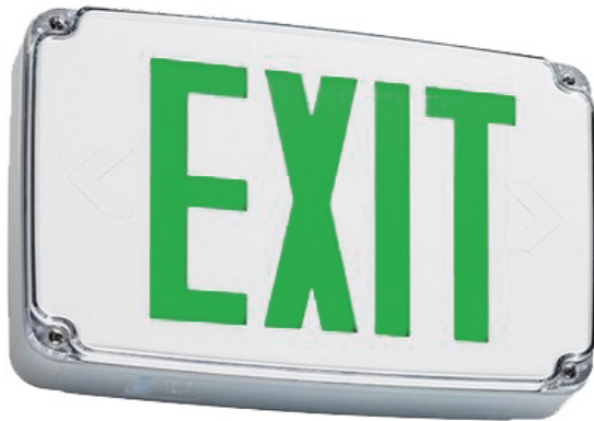
Green LED Letters Available