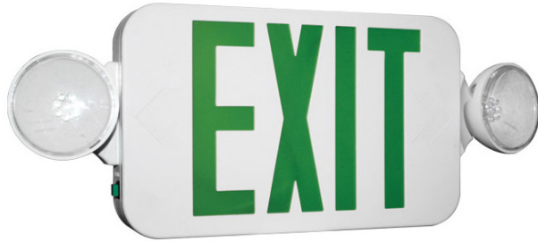
MINI-C Exit Sign Combo - Green Letters