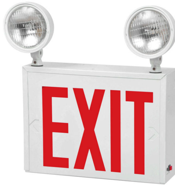
You can remove the 3rd lamp head if needed